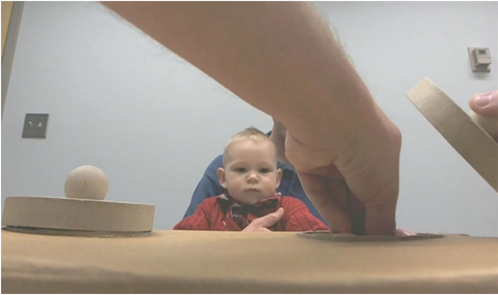
Figure 1. Example of an infant observing a contralateral reach during object hiding on an A-trial of the test phase.